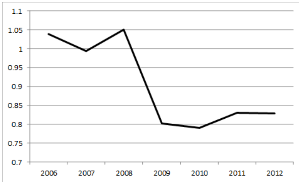
Figure 1: Euro Area Inflation AR(1) Coefficients

Notes: Year average inflation, 7-year rolling regression window, no constant. Datastream.